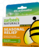
Seasonal Relief 30 Count