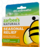
Seasonal Relief 10 Count