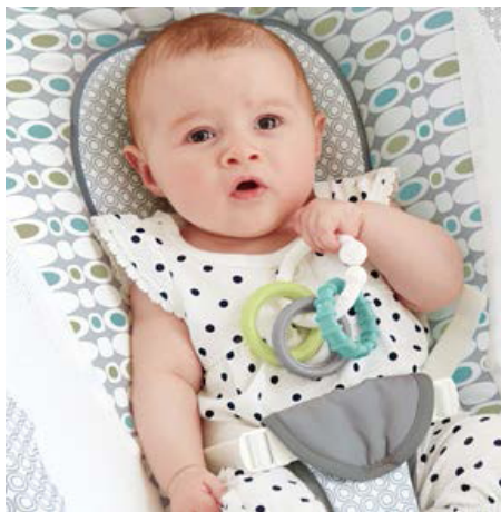
Above: Figure 3