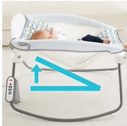
Above: Figure 2