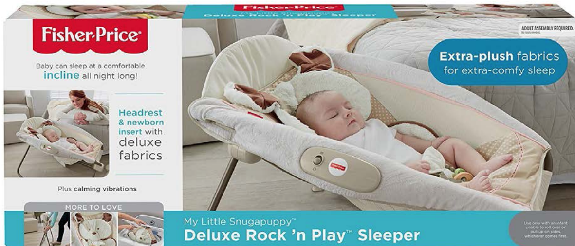
Above: Figure 6

96. One of the principal means of in-store advertising is the box in which the product is packaged. The boxes prominently tout that the product is suitable for all-night sleep as illustrated by the figures below showing typical packaging: