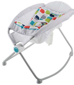
Above: Figure 1

soft padded material (Figures 4 and 5), upon which the baby is placed. Different views of the product are shown below: