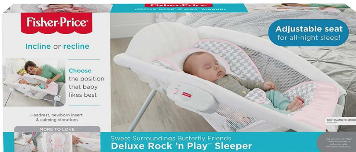
Above: Figure 8

97. The marketing statements on the packaging conflict with the AAP’s guidelines and recommendations, and those of other infant sleep experts.